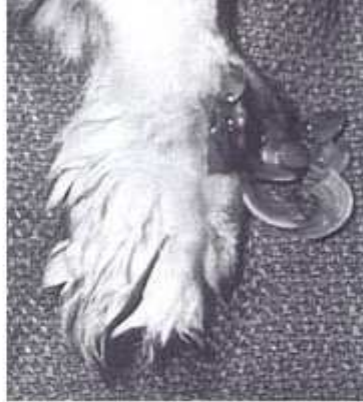
Regrowth of claws associated with inadequate amputation of the third phalanx of the first digit