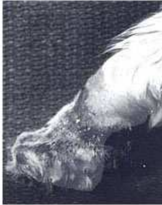
Necrosis and sloughing of soft tissue following onychectomy