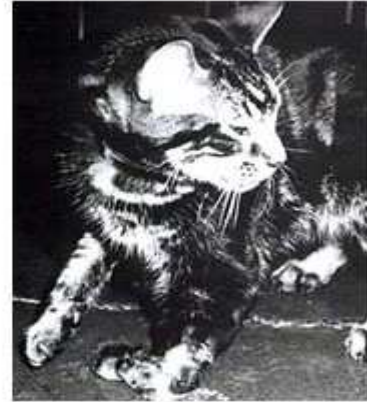
Radial neuroparaxia associated with onychectomy